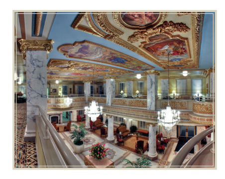
French Lick Springs Hotel (1845)