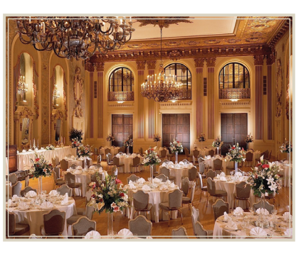
Hotel Du Pont (1913)