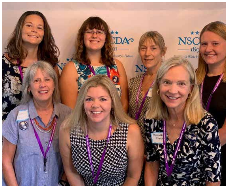
North Carolina Dames trained for oral history interviews with veterans.