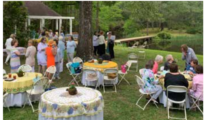
The Louisiana Society adapted to an outdoor format for their Annual Meeting in April.