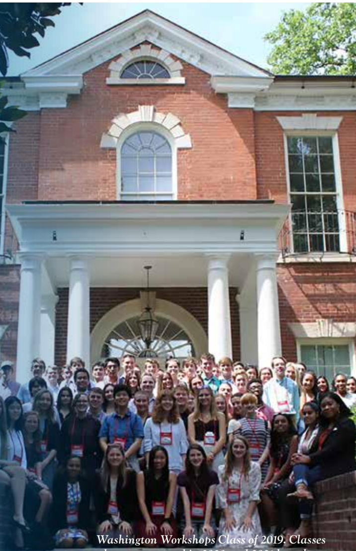
Washington Workshops Class of 2019. Classes that were paused in 2020 and 2021 have been invited to join the program in June of 2022

To make the Congressional Essay Contest possible for these bright minds to see democracy in action, participating NSCDA Corporate Societies fully fund their students by paying the workshop fee, which covers many expenses, including but not limited to travel, room, and board and a per diem to cover lunches while on tours. The NSCDA funds a few students through national scholarships. If the Corporate Societies have more applicants for scholarships than their funding will cover, or if they cannot fund a student, then they can submit the student's essay to be judged at the national level for a NSCDA scholarship. Students can also submit an essay to the NSCDA online if their states do not have a corporate society, or if the corporate society in their state does not participate. This experience is only possible through the NSCDA's strong and long-lasting partnership with the nonprofit, Washington Workshops Foundation, which runs the week-long civic adventure. The seminar provides two meals daily and an additional per diem, university campus housing and access to world-class museums, government offices, and memorable tours, including a visit to Dumbarton House and Gunston Hall.