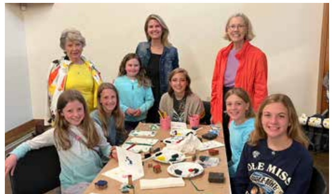
Nashville Dames gathered with their daughters and granddaughters for a Junior Dames Mother's Day event at Travellers Rest.