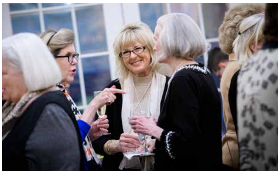
Dames gathered on the Lower Terrace and in the North Garden at Dumbarton House.